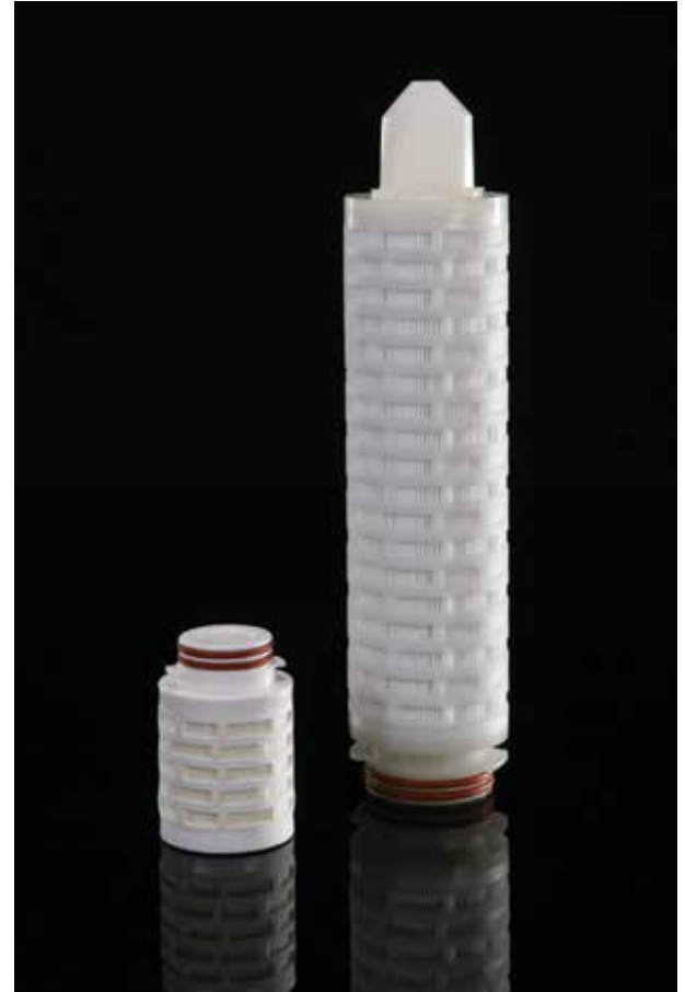
Note: PEPLYN is a registered trademark of Parker Hannifin Corporation.