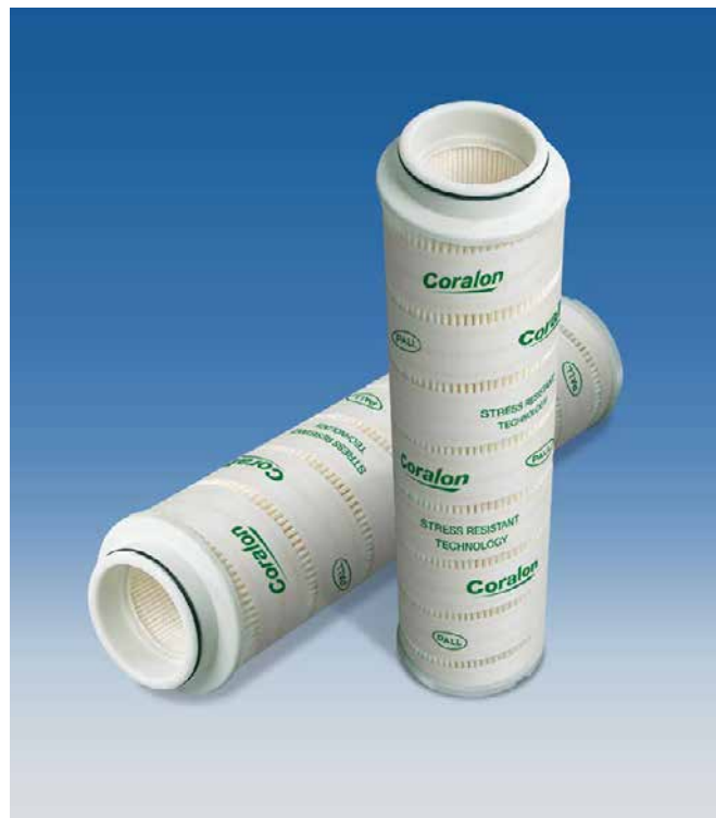
Coralon Filter Elements