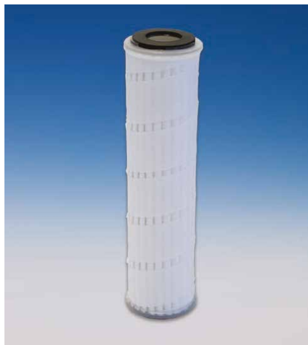
Profile UP Filter

For P and W options, the filters are constructed entirely of FDA-listed materials and the absolute rating of the filter is based upon the widely accepted modified Oklahoma State University (OSU) F-2 Filter Performance (Beta Rating) Test.